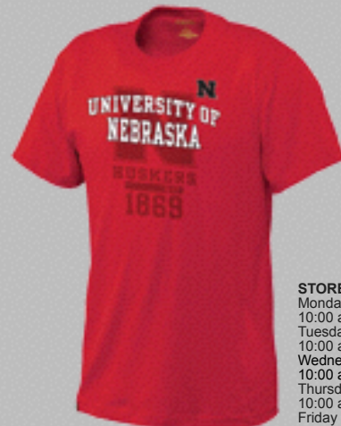
Style: T320 - Universtee Color: Collegiate Scarlet

STORE HOURS Monday 10:00 am – 6:00 pm Tuesday 10:00 am – 6:00 pm Wednesday 10:00 am – 6:00 pm Thursday 10:00 am – 6:00 pm Friday 10:00 am – 6:00 pm Saturday 10:00 am – 5:00 pm Sunday 10:00 am – 4:00 pm