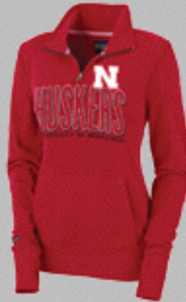
Style: T43E - Reebok 1/4 Zip Color: Collegiate Scarlet