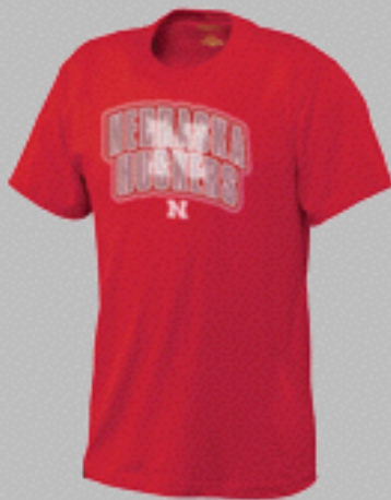
Style: T329 - Universtee Color: Collegiate Scarlet