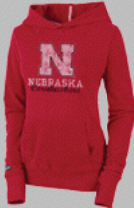
Style: T43C - Jackpot Hood Color: Collegiate Scarlet