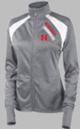
Style: T41F - Speed Pull Zip Poly Fleece Color: Graphite