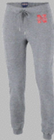
Style: T42S - NYC Pant Color: Graphite