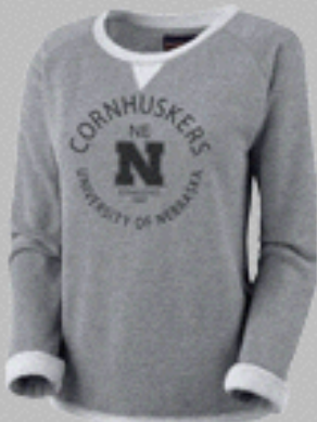
Style: T47 - Beehive Crew Color: Graphite

You can also see the Husker Gear on our FVH website!