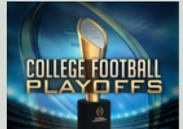
College Football Playoff Rankings